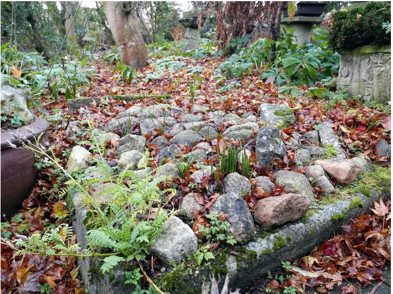
I thought I would show you a few more areas such as the cobble bed which will be among the first to break into flower in the early part of next year.