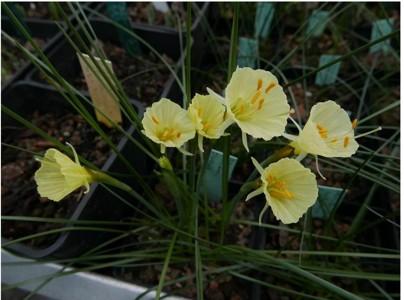
Narcissus romieuxii JWB8628