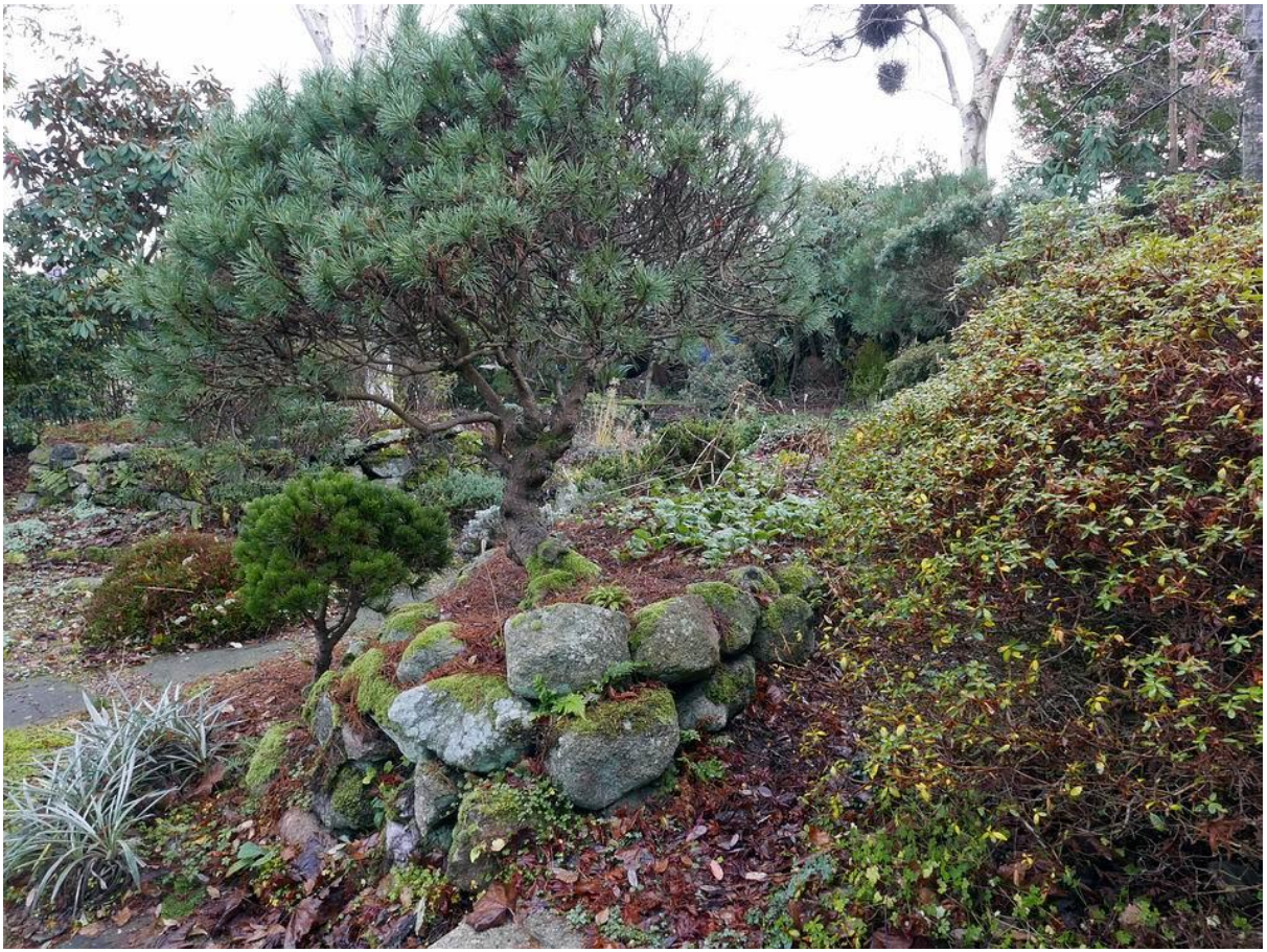
The raised wall with the pine tree is also full of early flowering bulbs and plants.