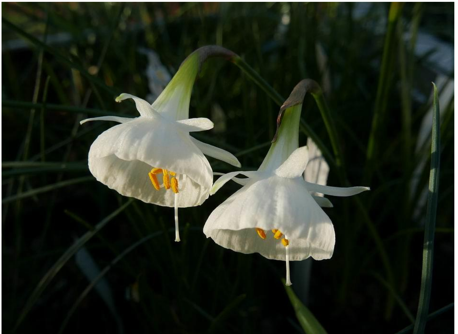
Narcissus 'Craigton Chalice'