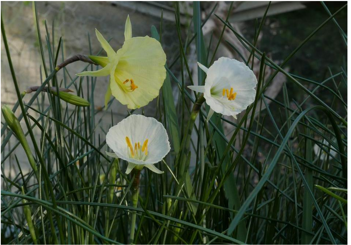
Some more of the many variations in shape and colour of the Narcissus we have flowering in the bulb houses just now with many more to follow throughout the winter months and well into spring.