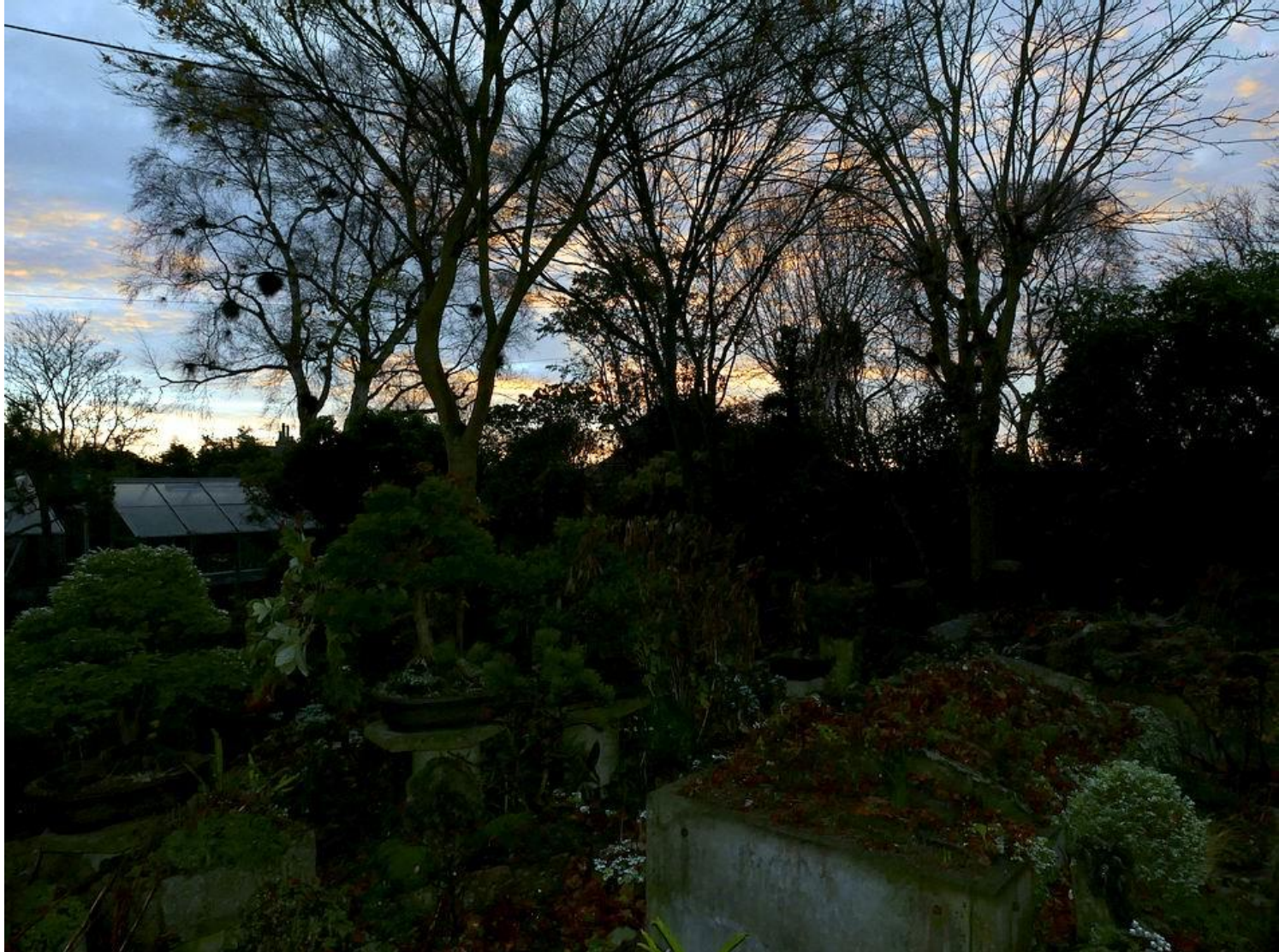
I will leave you this week with the light just before dawn.....

These Galanthus shoots remind me of the approaching dawn when you can see the sunlight being reflected back off the clouds before the sun breaks over the horizon filling the land with light. While the bulbs are mostly underground in the winter they are far from dormant their shoots are slowly expanding pushing slowly upwards some like these poke a nose out waiting to fill the garden with colour.