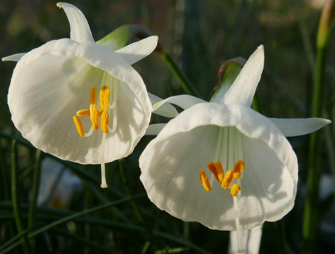
Narcissus 'Craigton Chalice'