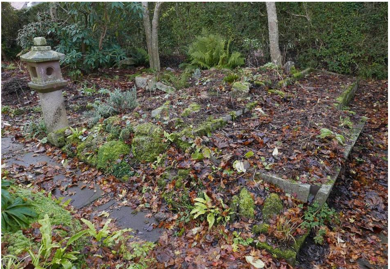
The rock garden bed on the left with the Erythronium frames on the right alongside the narrow path side bed which is planted with Corydalis and Hepatica .