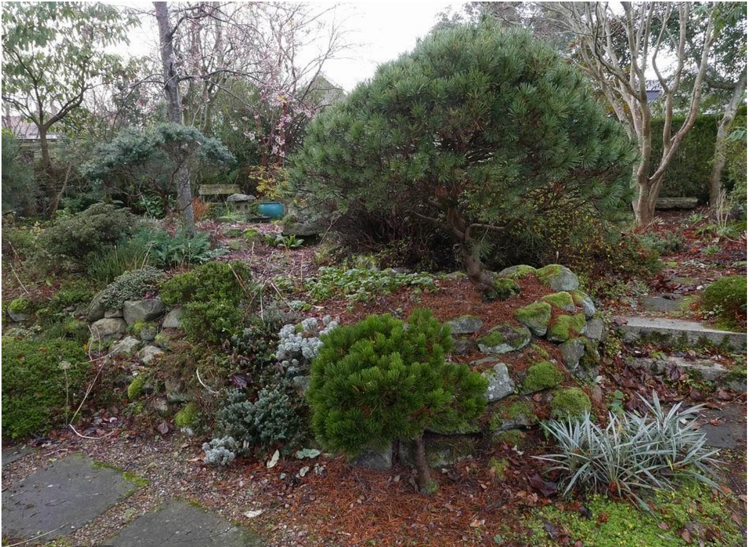
I hope to tidy these areas through the winter and before the early growth appears.